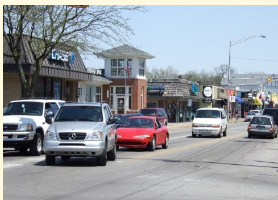
Photo: Main Street

Green Broad Ripple has been working with other communities to further the glass cullet manufacturing process. Emails directed to our website, www.greenbroadripple.org , have presented us an opportunity to assist groups from nearby Keystone at The Crossing to distant Kingston Springs, Tennessee. The grassroots environmental activists in Kingston Springs, located 30 miles west of Nashville TN, submitted a list of questions we responded to. In answering, we were very happy to share the benefit of our experience. They appeared delighted... read more